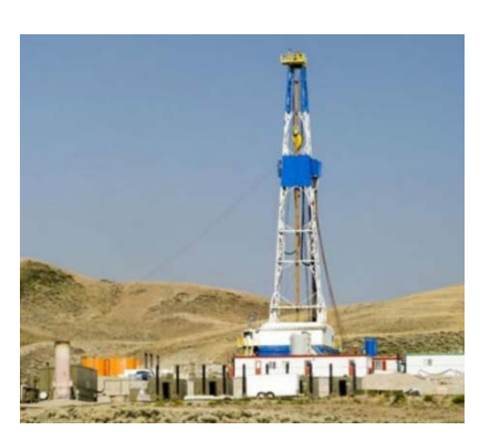
CO2 used tertiary injectant for natural gas field owned by gas company